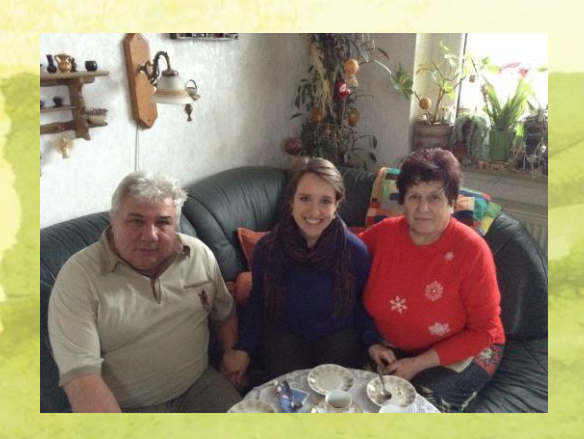
Visiting the Werners, my former neighbors in Germany

To make a donation, please send cash or check payable to <u>Britton Road</u> <u>Church of Christ</u> (sponsoring congregation)