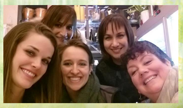
Spending time with some students before classes start.